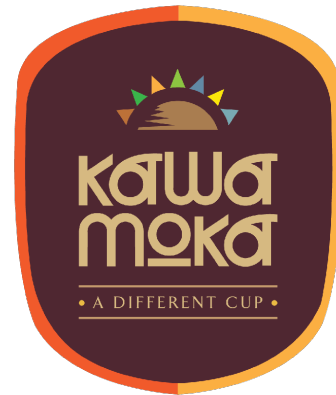
Design and Brand