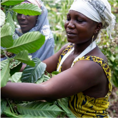
Empowering Women Through Coffee Production