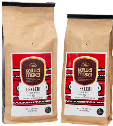
Eco-friendly Packaging & Production Method