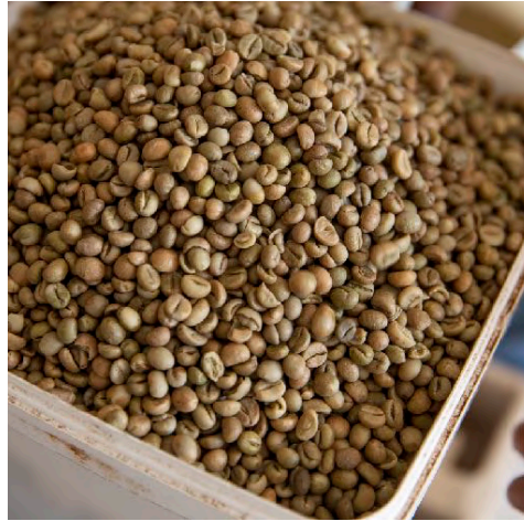
Market Leading Product Quality