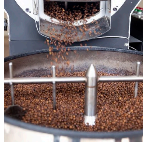
Cost Effective Supply Chain